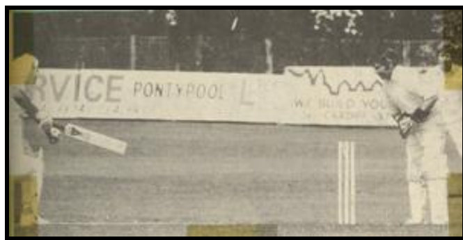
Eifion Jones in action behind the stumps