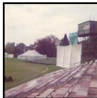
Preparation almost Complete, TV gantry in place