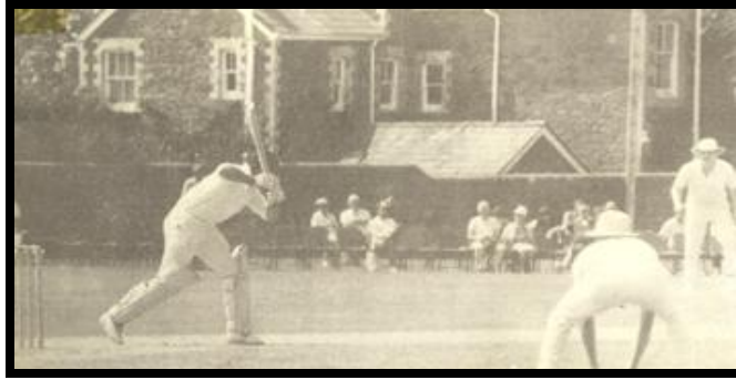
Alan Ormrod scores runs