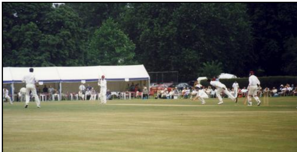
Above Waquar lets fly