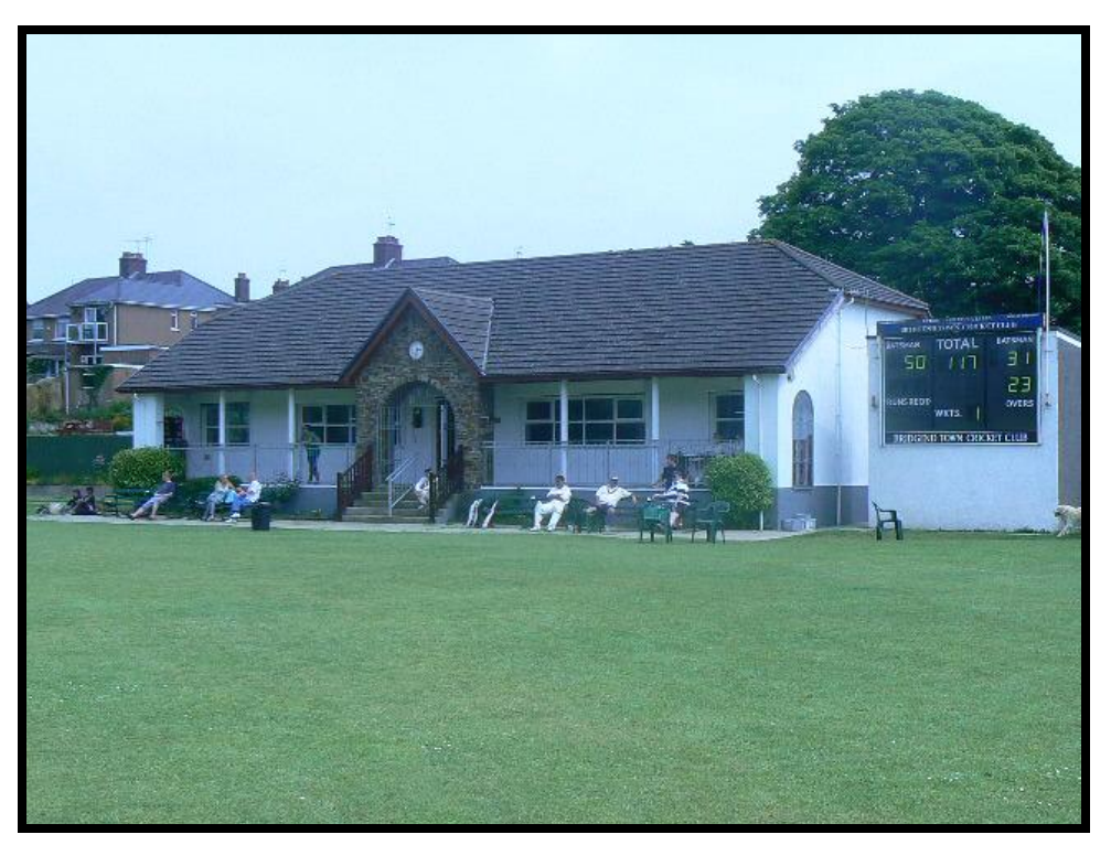
Bridgend C.C. Club House/Pavilion