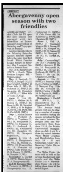
Pictured Left- The fixtures reported in the 'Chronicle'