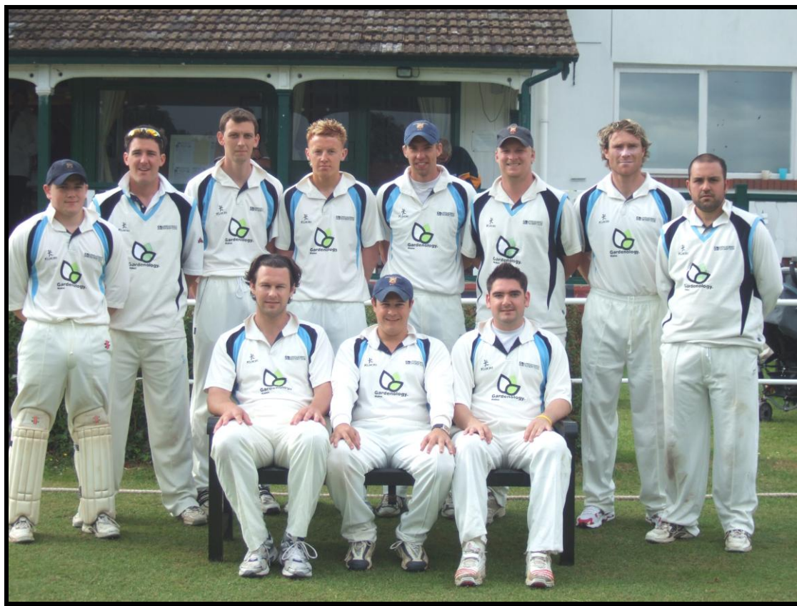
Abergavenny 1 st XI Pictured against Brecon