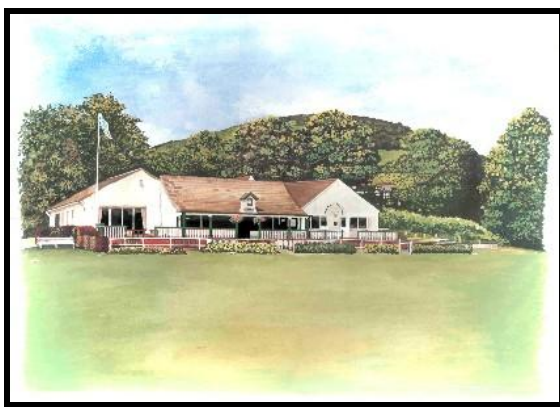
Winter and Spring pictures of the Avenue Road pavilion

WITH Cardiff playing host to the first npower Ashes Test match between England and Australia, 2009 is an historic year for Welsh cricket.