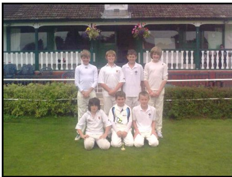
Under 13 Team

ABERGAVENNY'S second eleven cruised to a comfortable nine wicket victory over local rivals Chepstow last Saturday at Avenue Road.