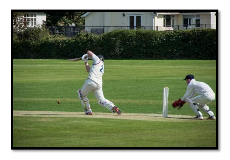
Abergavenny v Swansea

"It will also allow common processes with respect to discipline and child welfare. It is not about accepting a lowering of standards."