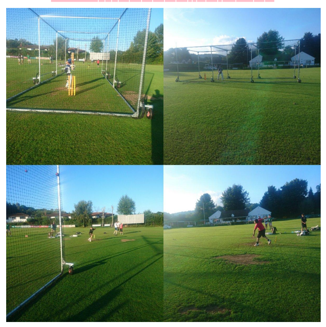
Final Junior Practice Night