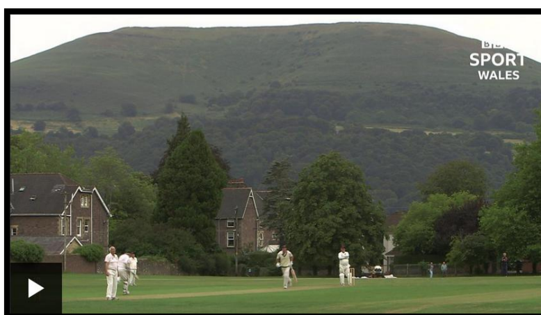
Wales 70's v Australia 70's

The First X1 fixture away to Cardiff Gymkhana never began as it was cancelled due to the weather before a ball could be bowled. Abergavenny 1 st X1 remain in 8 th position in the League, with four games to go there is still a chance of climbing up the table although promotion is probably out of reach.