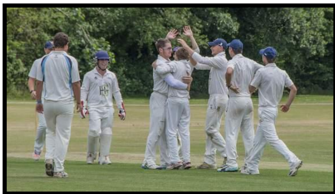
Pictured Left- 2 nd X1 players celebrating a wicket together

Some disruption early season as the Chair of Cricket, 3 rd X1 Captain and Fixture Secretaries resigned on a point of principle. They later returned to the fold