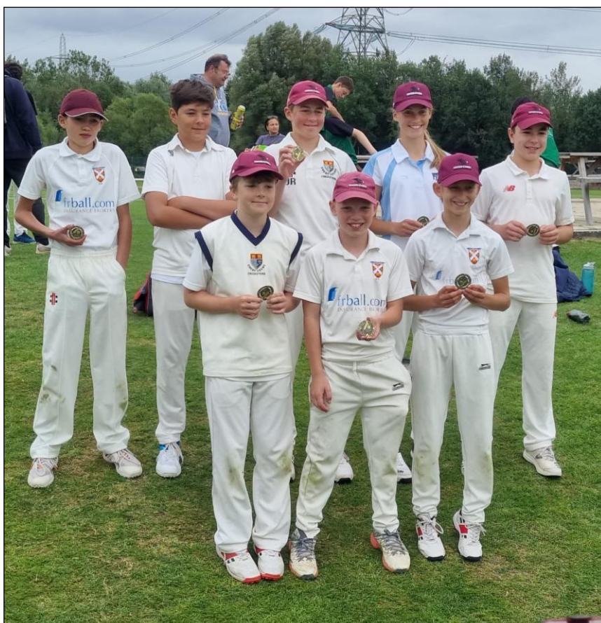
Gwent Super 8 2021 Under 13 Winners