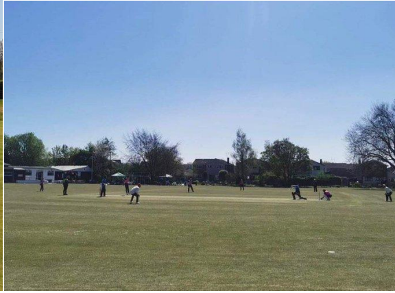
Canon Frome and Congrebury CC