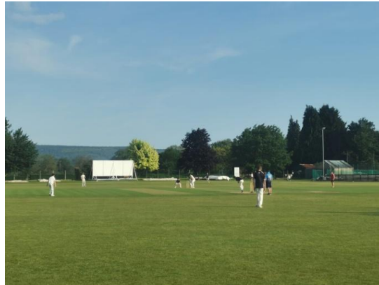
Usk CC Ground