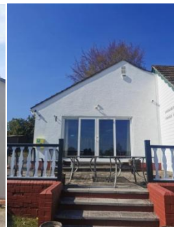
The makeover is also on the outside of the building