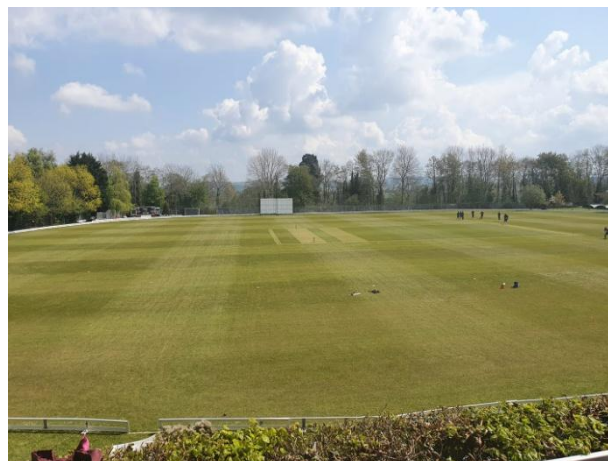
Panteg Cricket Ground