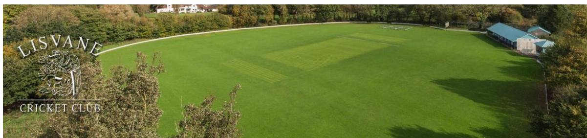
Lisvane Cricket Ground