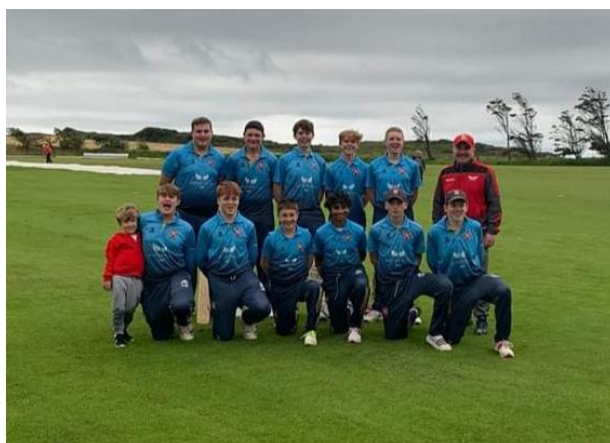
Abergavenny Under 19 X1