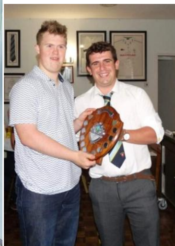
Six a Side Winners- The Traffic Cones