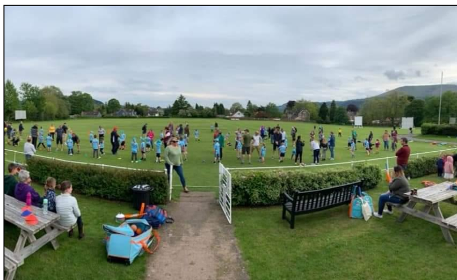
A very healthy turn out for the All Stars and Dynamos at Avenue Road

Usk had no problem chasing the total down, reaching 105-1 in just 16.5 overs to take 20 points.