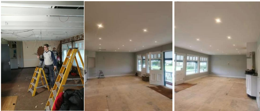
Refurbishment of the Clubhouse

Due to Covid 19 the 2021 AGM which normally would have taken place in December. Through the winter of 2020 and early part of 2021 the Club house has undergone an update.