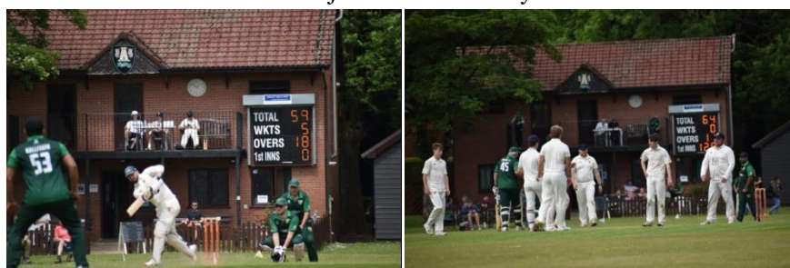
Pictured at Rogerstone