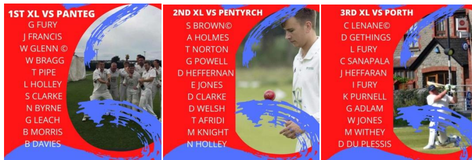
The teams selected for the First League games of the new season