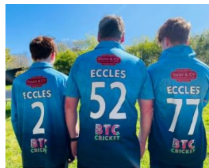
A trio of Eccles