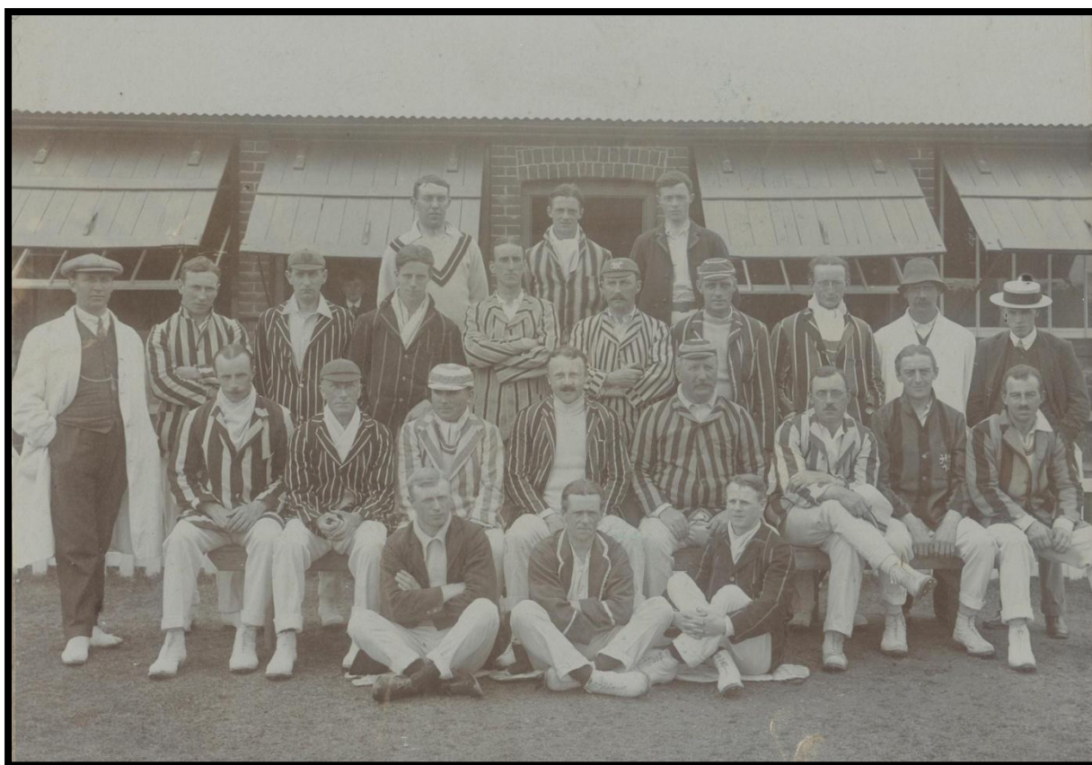
Gentlemen of Monmouthshire v Gentlemen of Carmarthenshire Played July 17 th & 18 th 1913 at the College Ground Llandovery The Monmouthshire X1 contained no less than five (6) Abergavenny players