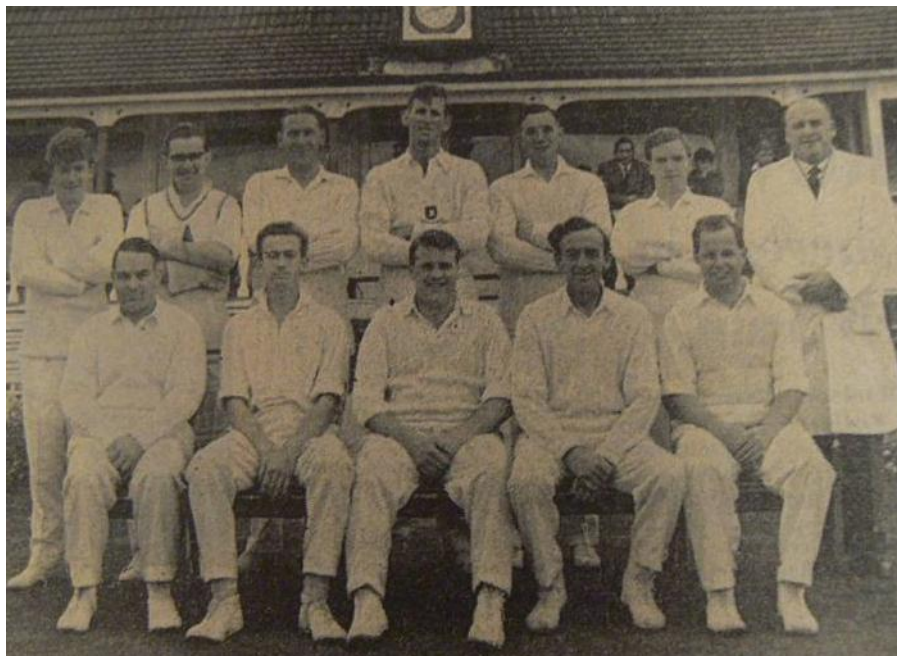
Abergavenny 1 st XI-1965