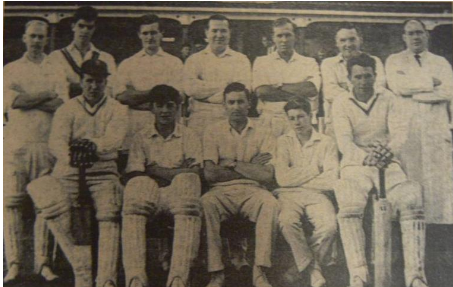
Abergavenny 2 nd XI-1965