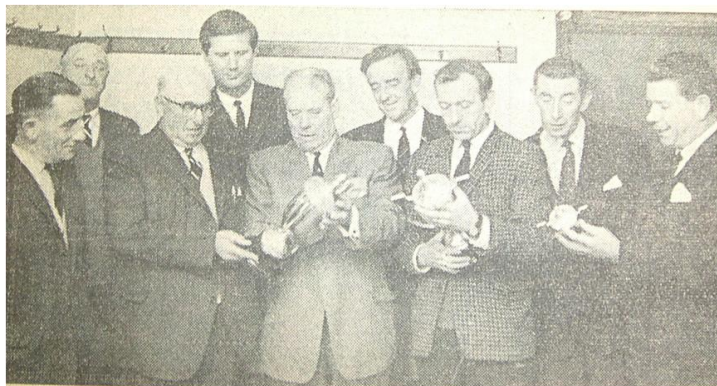
Pictured below Left