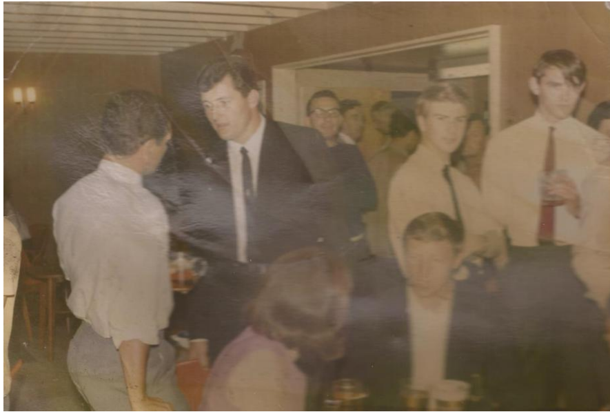
Keith Jarrett [Centre]