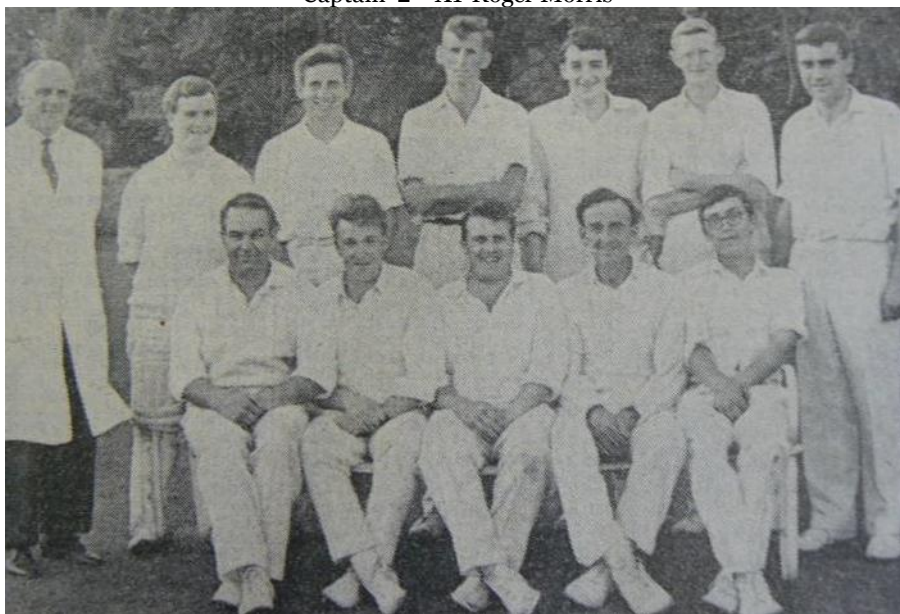
Abergavenny 1 st X1- 1967