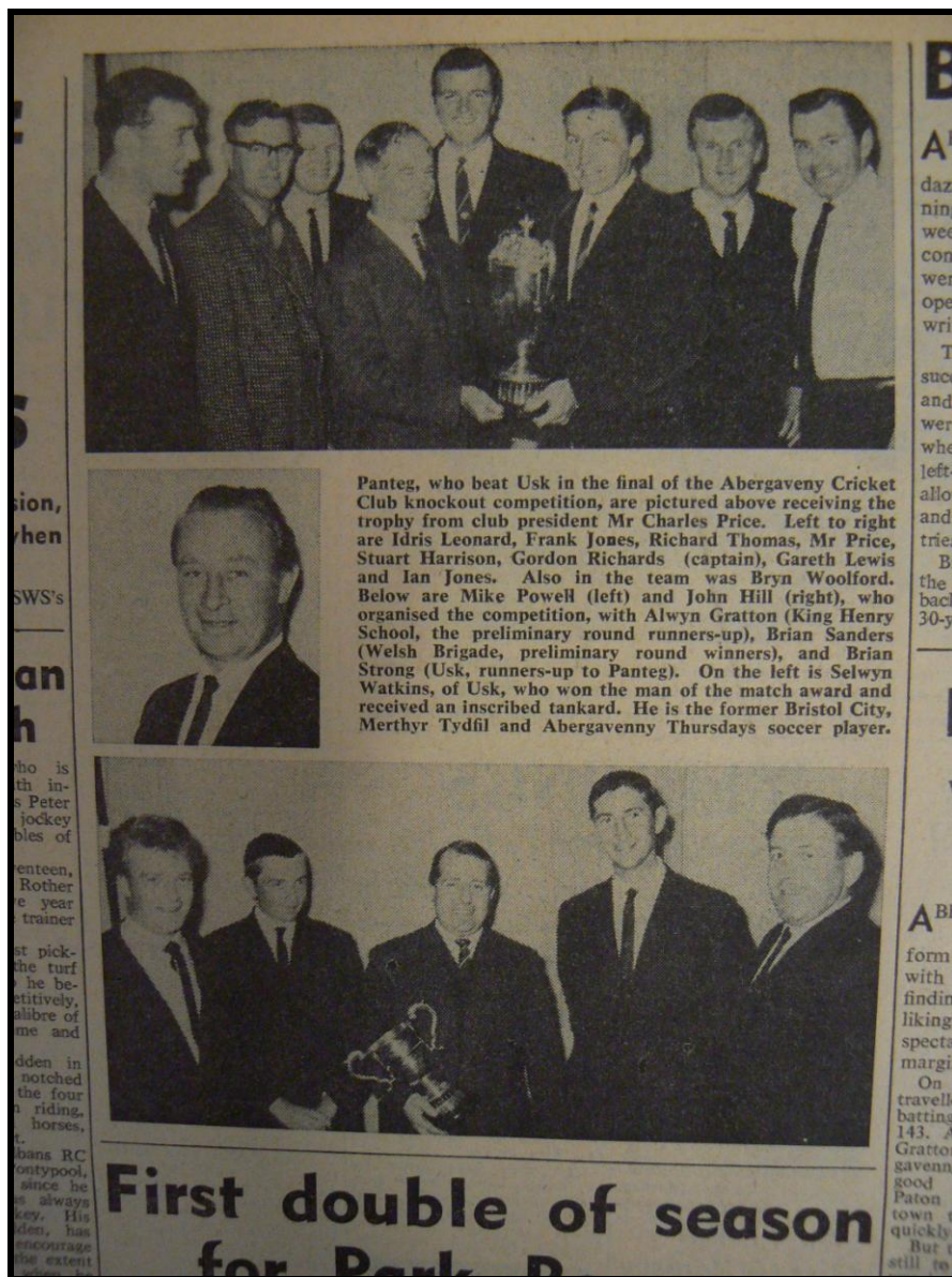
Presentation Night for the 8 a Side knock Out Cup