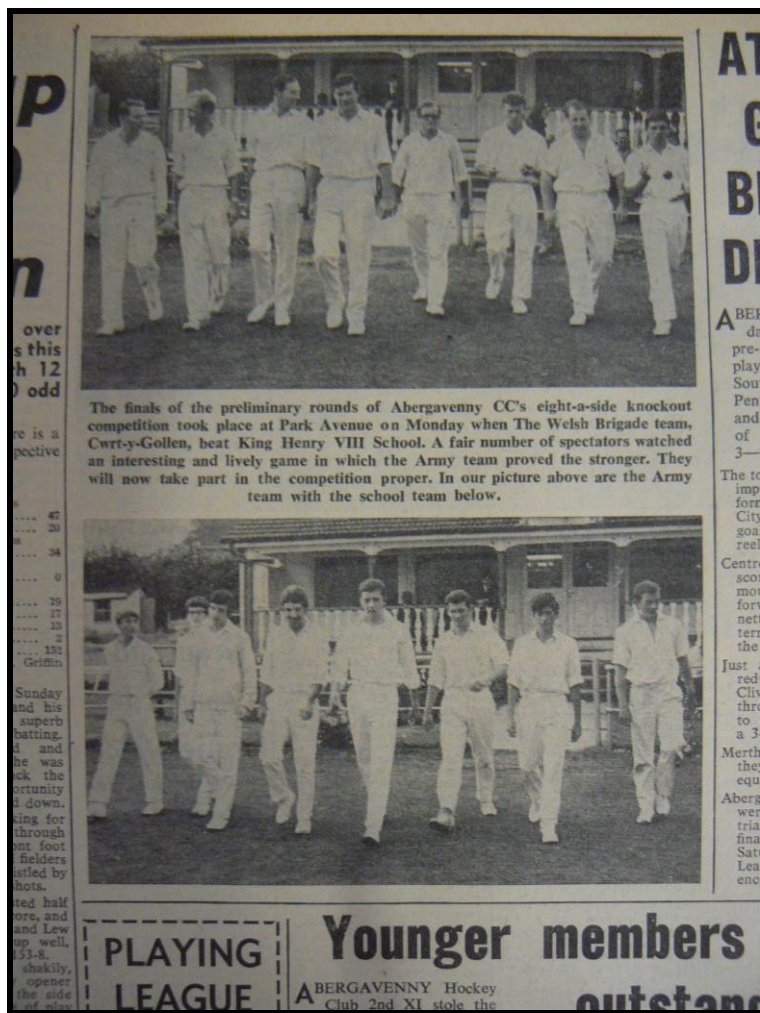
Pictured above are the King Henry V111 School and The Welsh Brigade Teams