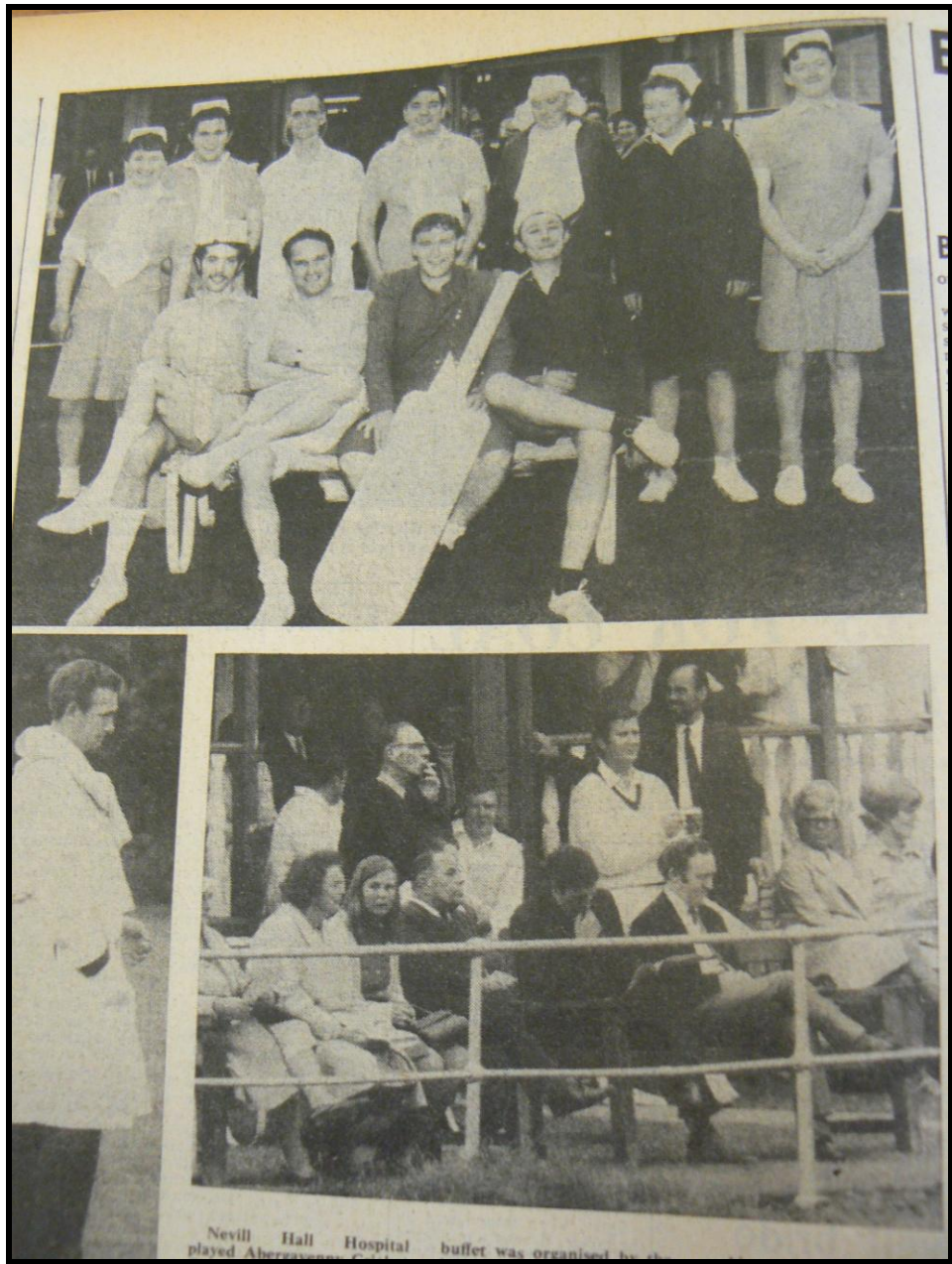
Local Hospital Nevill Hall used the ground for a Fun Game of cricket for Charity against the Abergavenny Chairman's X1