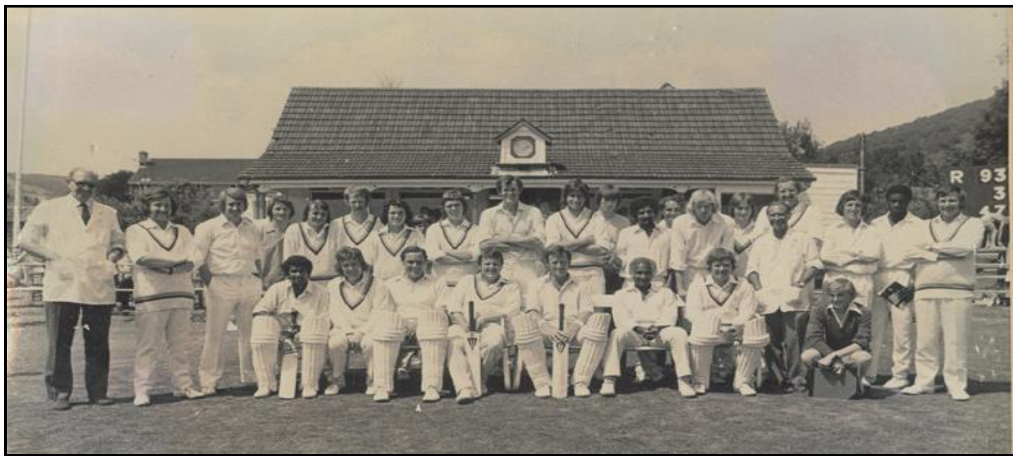
Dennis Amiss Benefit 1975 Abergavenny v Warwickshire Back Row L-R