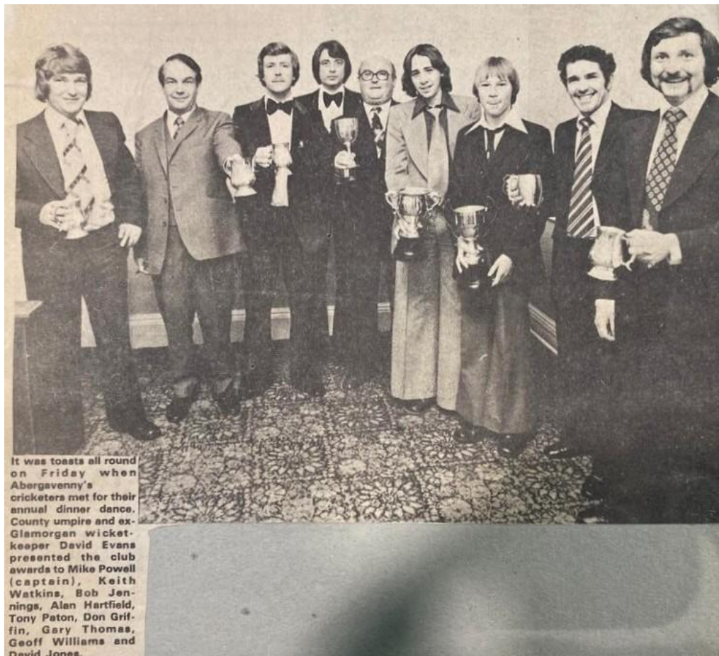
Abergavenny v Chepstow June 1977