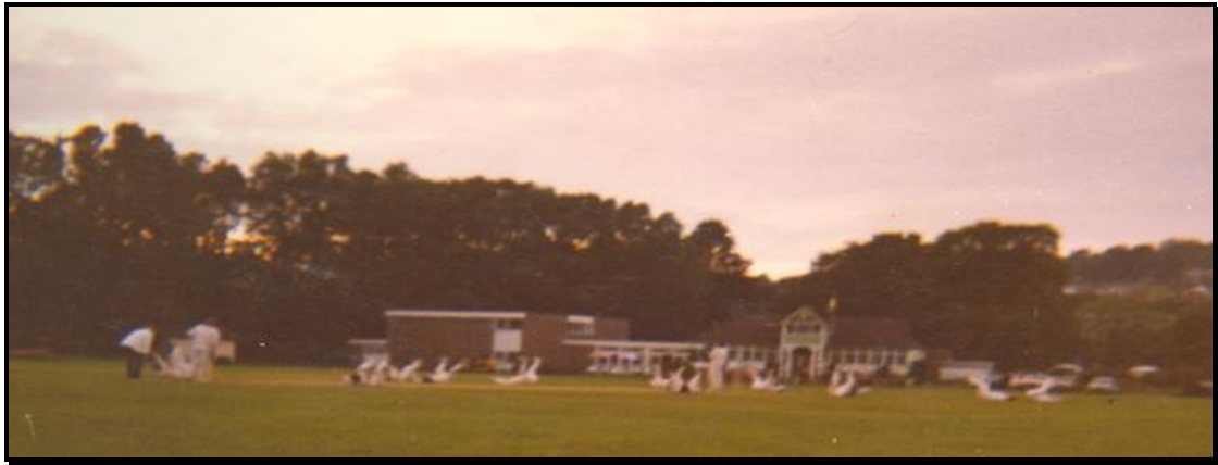
Pictured above the 'dead fly' at Hythe Cricket Clu