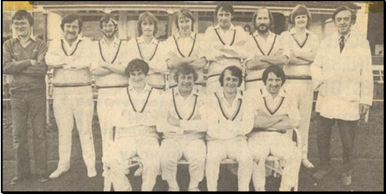
Abergavenny 1 st XI-1979