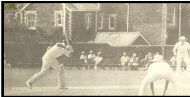
Left-Alan Ormrod scores runs