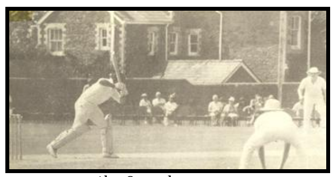
Alan Ormrod scores runs