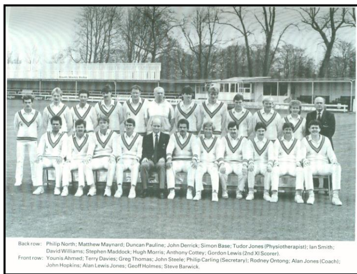
Pictured below Glamorgan C.C.C.for the 1986 Season