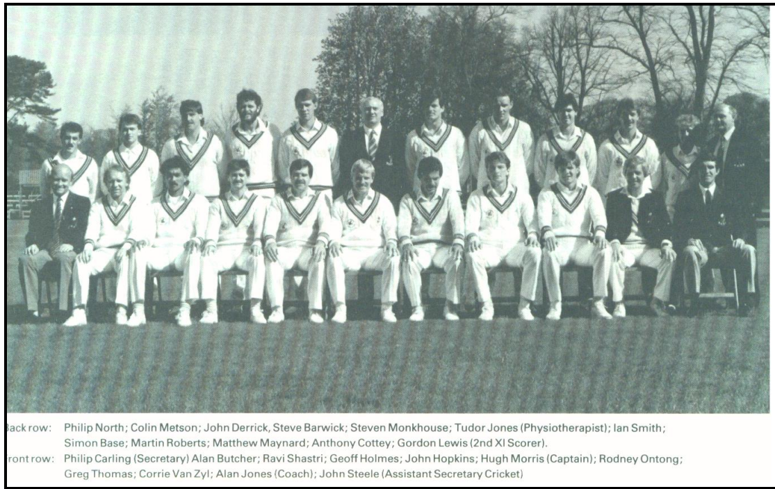
The Glamorgan Squad of 1987, 10 years later in 1997 they would still be playing Championship cricket at Abergavenny