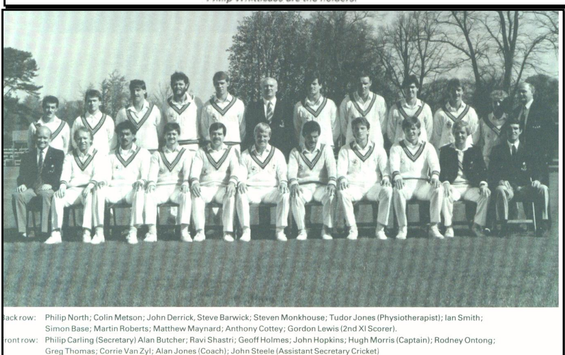
The Glamorgan Squad of 1987, 10 years later in 1997 they would still be playing Championship cricket at Abergavenny