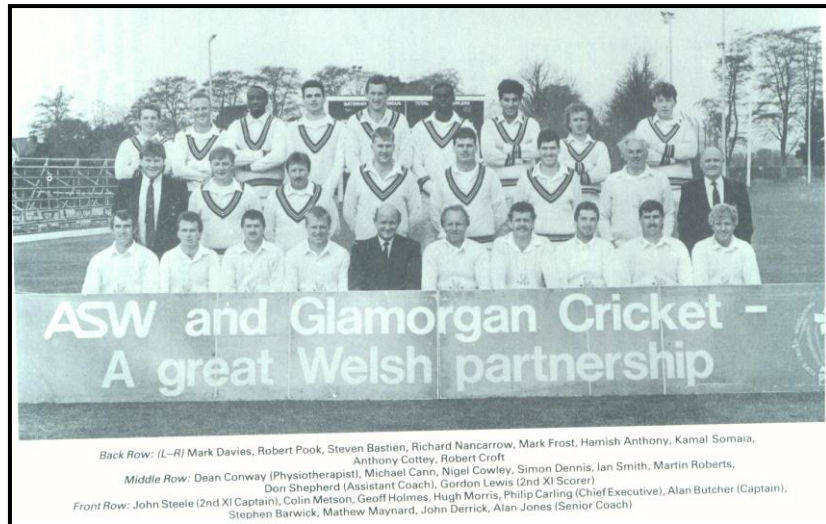
Pictured Above the Glamorgan C.C.C. Squad- 1990