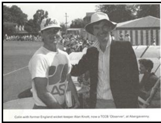
Colin with former England wicket keeper Alan Knott, now a TCCB 'Observer', at Abergavenny.